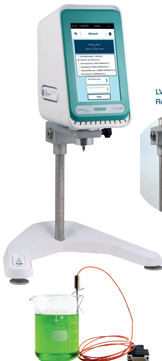
LV SPRING GuardLeg Ref. 100685