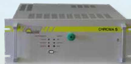
chromaS system 4U