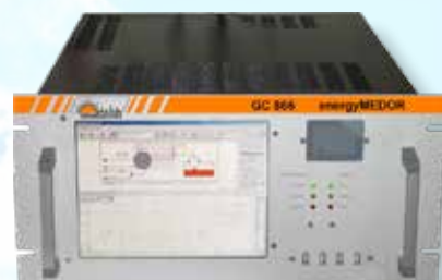
EnergyMEDOR® system 5U