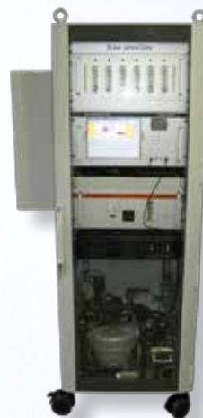
Waste Water Treatment cabinet