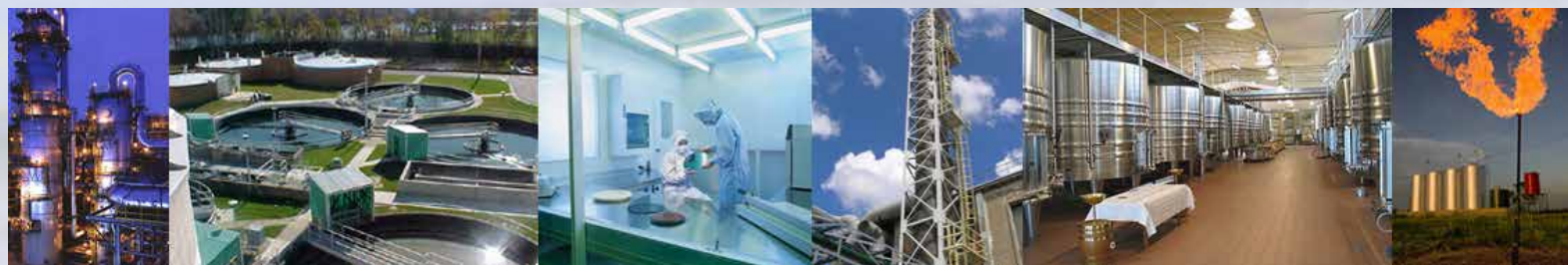
Control Emission Monitoring