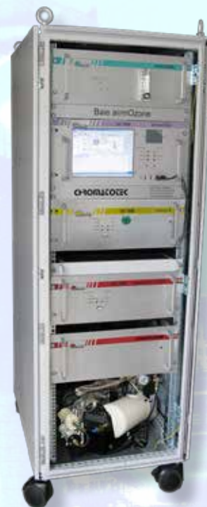
Odor's & VOC's Cabinet