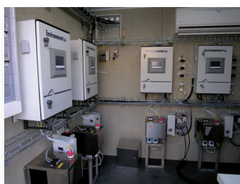
MIR 9000 - customized installation