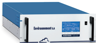
MIR 9000 19" rack version

Designed to measure dry and corrosive sample, the MIR 9000 measures up to 10 gases simultaneously: HCl, HF, NO, NO 2 (NO x ), SO 2 , CO, CO 2 , N 2 O, CH 4 , TOC and O 2