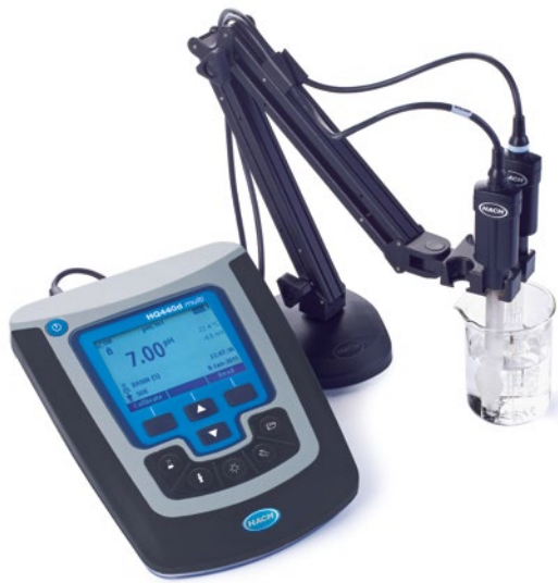
HQD benchtop multi-meter