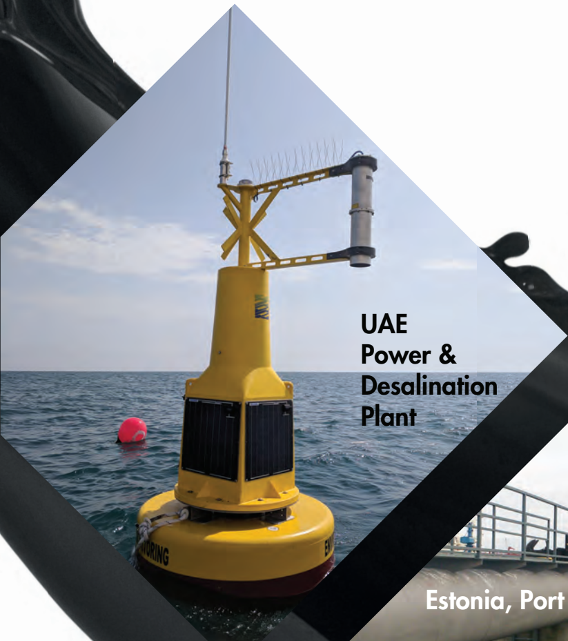
UAE Power & Desalination Plant

The ROW can connect seamlessly to your preferred telemetry monitoring devices whether using RS-485 Modbus, 4-20mA PLC (SCADA), or a simple alarm relay.