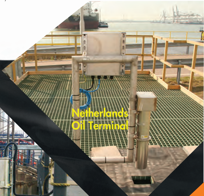
Netherlands Oil Terminal