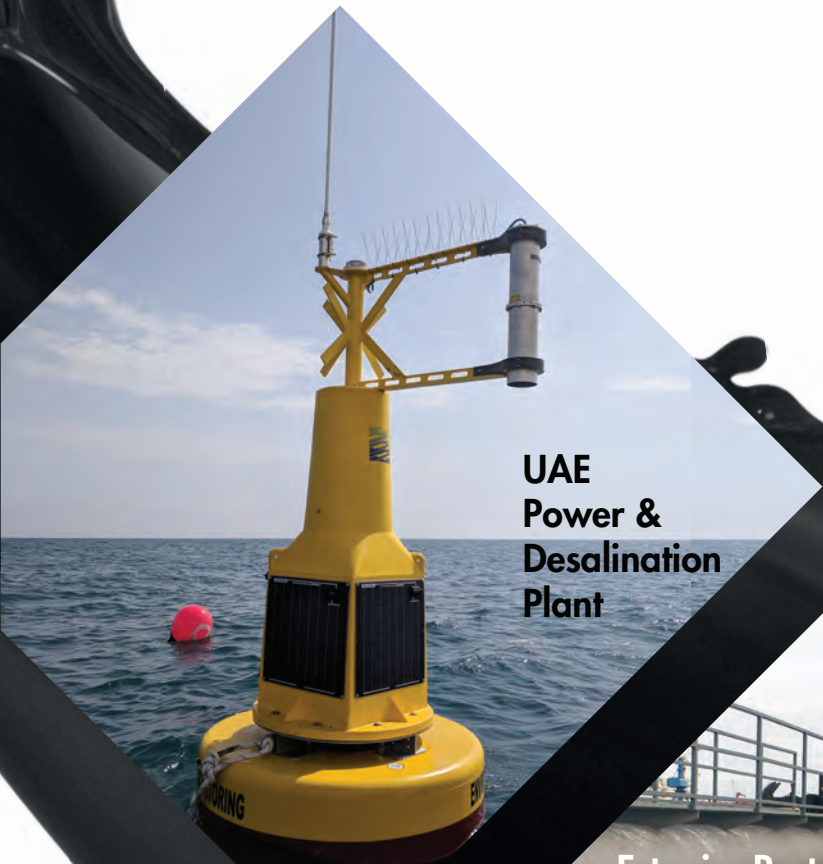
UAE Power & Desalination Plant

The ROW can connect seamlessly to your preferred telemetry monitoring devices whether using RS-485 Modbus, 4-20mA PLC (SCADA), or a simple alarm relay.